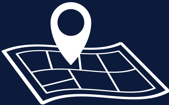
Click on the icon to view the route to the residential area.